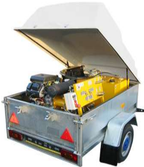
POWER PACK ON ONE-AXLE TRAILER