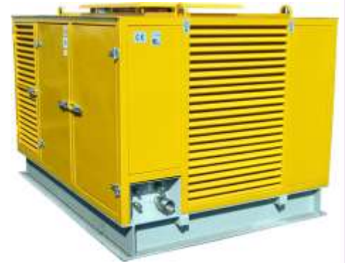
POWER PACK IN HOUSING ON FRAME

Hydraulic exhaust power packs are offered in following housing versions: