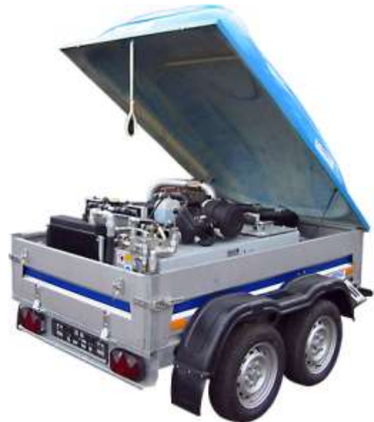
POWER PACK ON TWO-AXLES TRAILER